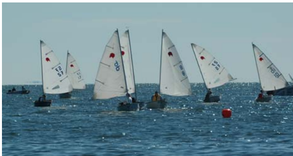
Old Sea Dogs and the Sea Dog 2010 compete side-by-side in local fleets.